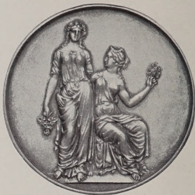
For Cymbidium pauwelsi Mass. Hort. Society April 6, 1921